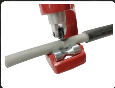
STEP 4: CIRCUMFERENTIAL CUT ON INNER SHEATH