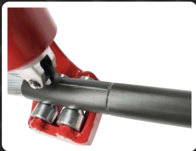
STEP 2: LONGITUDINAL CUT