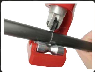
STEP 1: CIRCUMFERENTIAL CUT

Complete 5-step process of using the SACS® Tool. Cutting wheel depth will vary according to cable size, progressive advancement is best.