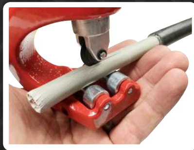
STEP 5: LONGITUDINAL CUT & REMOVAL OF SECONDARY SHEATH