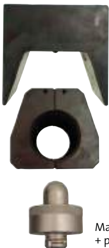
Matrix holder V1471 + matrix W60M + punch W60D.