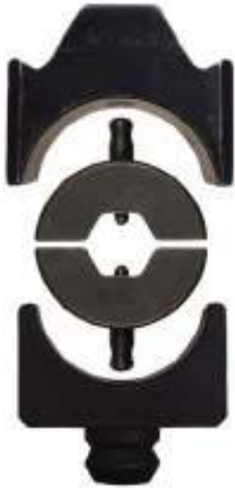
V1318 + B type dies + V1316.