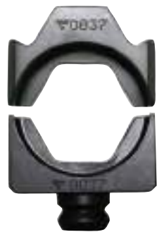
Integrated dies 13B38.