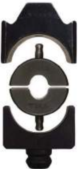
V1318 + BC type dies + V1316.

* All dies type 13Bxx are used without die holder .