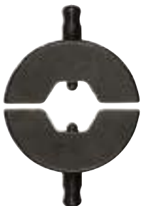
B type dies.