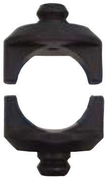
Die holders V1330 (pair).

If not otherwise indicated, use die holder V1330 .