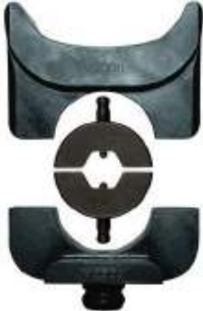
Die holder V2508 + B-dies + die holder V2506.

For hexagonal crimping of Cu terminals and connectors. If not otherwise indicated, use inner die holder V2506 and outer die holder V2508.