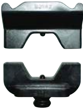
Die pair B2542.