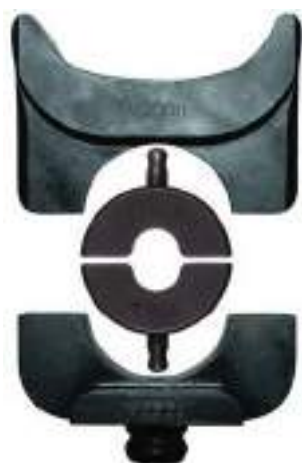
Die holder V2508 + BC-dies + die holder V2506.

For oval crimping of Cu branch connectors (C sleeves). If not otherwise indicated, use inner die holder V2506 and outer die holder V2508.