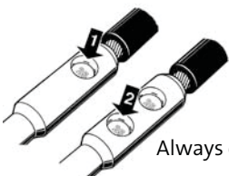
Always crimp twice on Al.