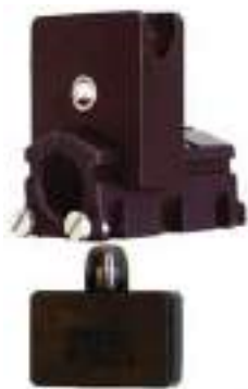
Matrix holder TV2620, matrix TP13M and punch TP13D.