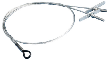
nVent CADDY Speed Link Y-Toggle with Eyelet Extension