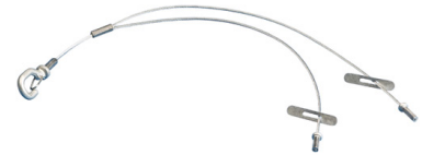
nVent CADDY Speed Link Y-Toggle with Hook Extension