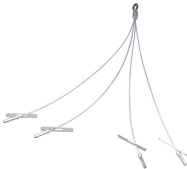
nVent CADDY Speed Link Quad-Toggle with Eyelet Extension