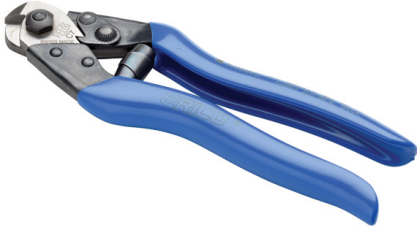
Wire Rope Cutter