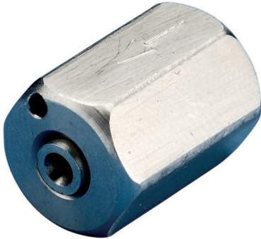
nVent CADDY Speed Link LD Locking Device