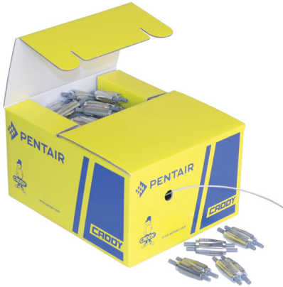
nVent CADDY Speed Link SLK Spool Kit

The individual components of the nVent CADDY Speed Link Universal Support System can be configured to meet installers' unique needs. nVent CADDY Speed Link locking devices and wire rope are available in bulk and allow installers to customize the system for each project.