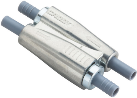
nVent CADDY Speed Link SLK Locking Device