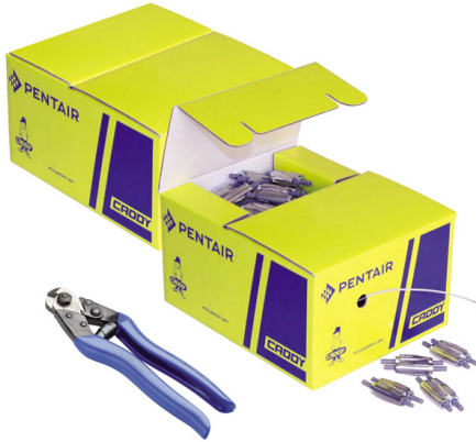
nVent CADDY Speed Link SLK Spool Kit with Wire Rope Cutter