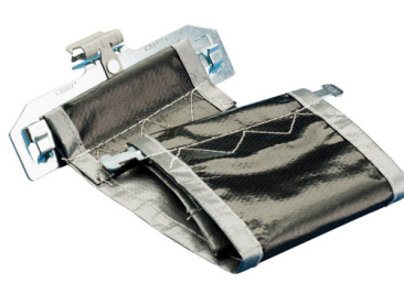
nVent CADDY Cat 425 Adjustable Cable Support with Flange Clip