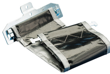
nVent CADDY Cat 425 Wall Mount Adjustable Cable Support