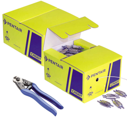
nVent CADDY Speed Link SLK Spool Kit with Wire Rope Cutter