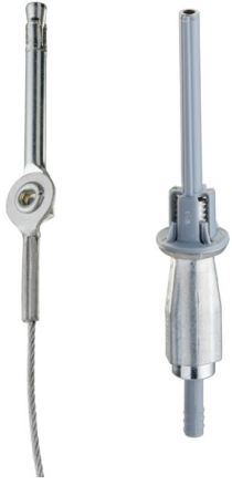
nVent CADDY Speed Link SLS with Wedge Anchor