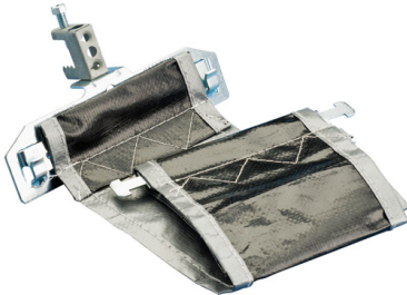
nVent CADDY Cat 425 Adjustable Cable Support with BC Beam Clamp