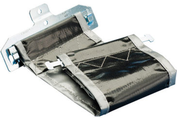
nVent CADDY Cat 425 Wall Mount Adjustable Cable Support