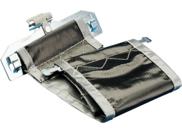
nVent CADDY Cat 425 Adjustable Cable Support with Flange Clip