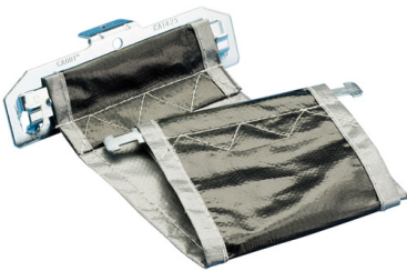
nVent CADDY Cat 425 Adjustable Cable Support