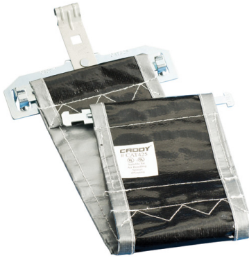
nVent CADDY Cat 425 Adjustable Cable Support with Z Purlin Clip