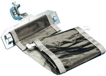
nVent CADDY Cat 425 Adjustable Cable Support with BC200 Beam Clamp