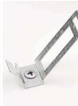
Conduit Clip 20 with D-Fixing