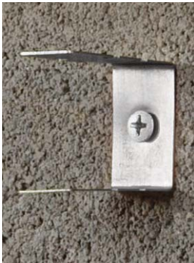
D-Fixing in Safe-D U-Clip 40

*Pullout loads based on 35mm embedment, 4mm pilot hole