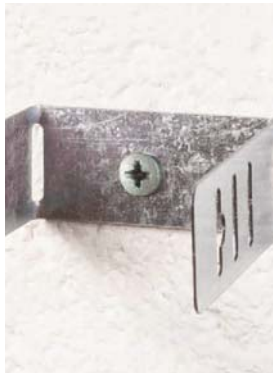
D-Fixing in Safe-D F-Clip 50