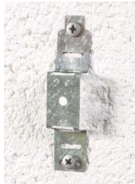
2x D-Fixings in Safe-D F-Clip 40