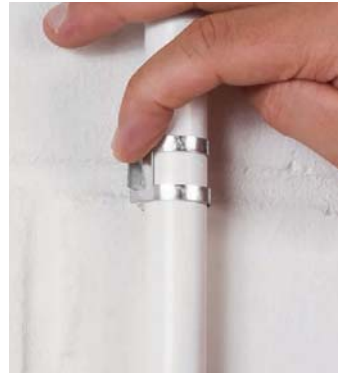
Secure conduit with locking tab