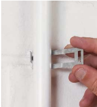
Provides a 3mm stand off from the surface