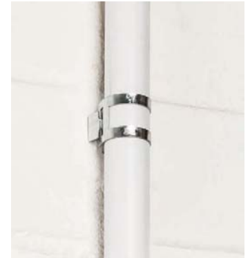
Centralised base fixing, gives a neat appearance to installation

Safe-D Conduit Saddles combine fire performance, quickest fix, and a modern look, to secure cables in 20mm & 25mm outer diameter PVC and galvanised conduit installations... & 20mm or 25mm o/d cables and pipes.