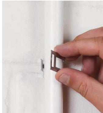
Simply wrap around the conduit, perfect for tight spaces