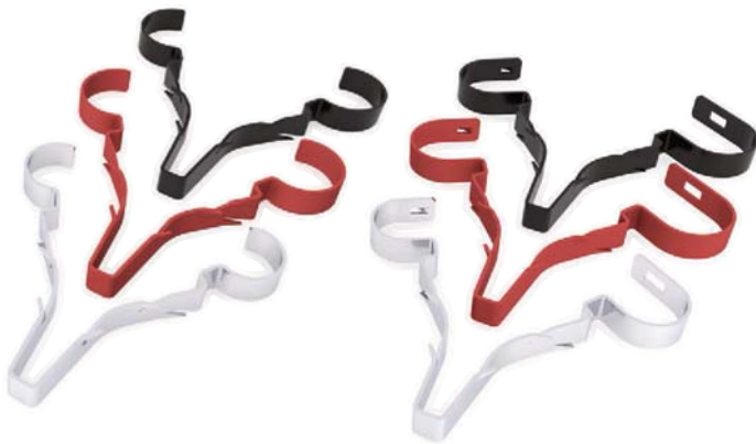
For 1x cable options 6-8mm & 8-10mm