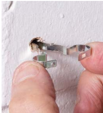
Drill pilot hole & select appropriate size of Stag Clip