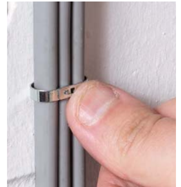
Push home to secure the Stag Clip and cable(s)

Safe-D Stag Clips can be first-fixed with their lower barbs gripping in pilot-holes, ready for second-fix cabling works.