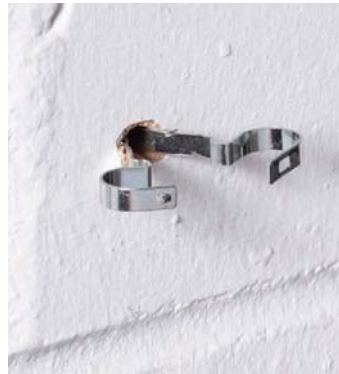
Rest Stag Clip in the pilot hole ready to accept cable(s)