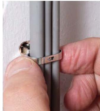
Insert cable(s) before squeezing the smooth head