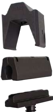
Matrix holder V1320, matrix R6MR, punch 13R6DR.