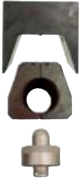
Matrix holder V1471, Matrix W60M, punch W60D.