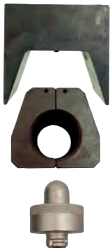
Matrix holder V1471, Matrix W60M, punch W60D.