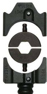
Outer die holder V1318, BNP dies, inner die holder V1316.