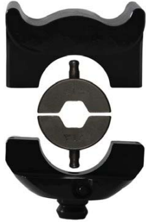
Die holder V2508, BNP dies, die holder V2506.