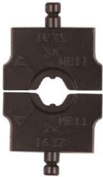
Die pair MB11 for PVL350.