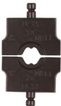
Die pair MB11 for PVL350.