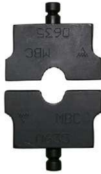
Die pair MBC5 for PVL350