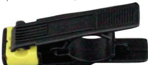
Cable stripper LOKE.