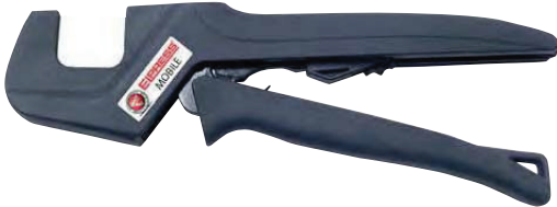
Elpress Mobile, frame only.