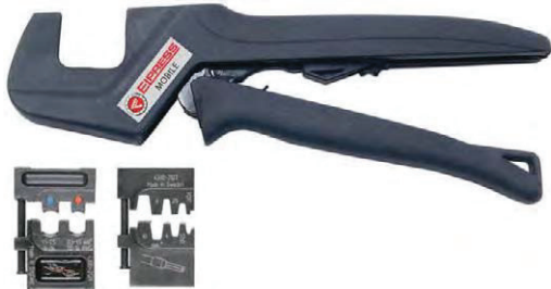
Elpress Mobile + dies OAA0525 and OEB0210.