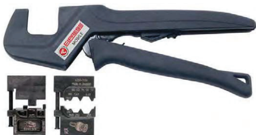
Elpress Mobile + dies OMP45 and OCC1113.