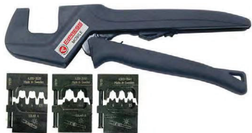
Elpress Mobile + dies OMS4, OMS3 and OMSL.

Mobile hand tool with three interchangeable dies and cable stripper LOKE for stripping solar panel cable with extra thick insulation: