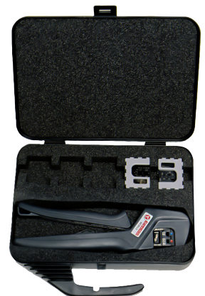
Box for the mobile tool with room for the tool as well as 5-6 associated dies.

OEB0210 Crimping die for Elpress MOBILE tool for crimping end sleeves 0.25-10 mm 2 . AWG 24-7.