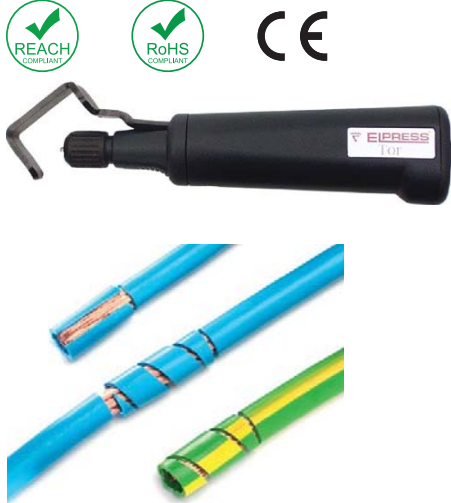
Three stripping functions.