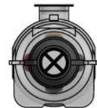
4 core Solid Aluminium (A or C) : 4 core Solid Aluminium (A or C)