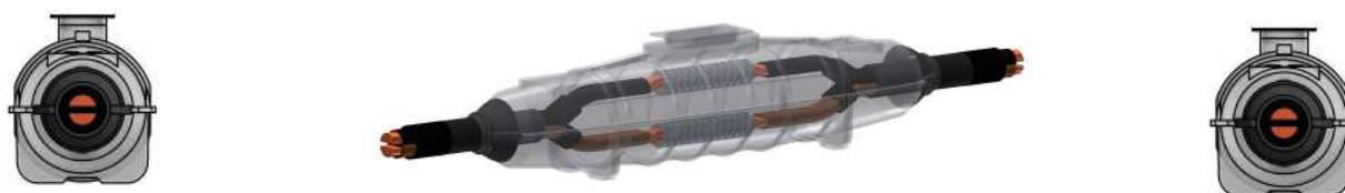
2 Core Copper (D or E) : 2 Core Copper (D or E)

Designs specific for same conductor type and sizing (eg. core 50mm 2 Str Cu to 2 core 50mm 2 Str Cu)