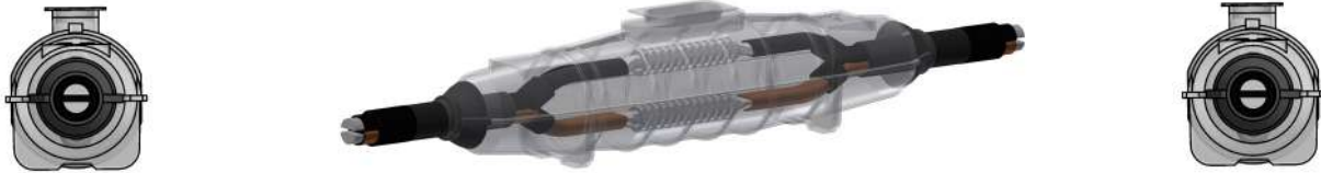
4 core Solid Aluminium (A or C) : 4 core Solid Aluminium (A or C)

Designs to allow the change from Solid Aluminium to Stranded Aluminium conductor type (eg. 50mm 2 SAC to 50mm 2 Str Al)