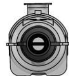
2 core Solid Aluminium (A or C) : 2 core Solid Aluminium (A or C)