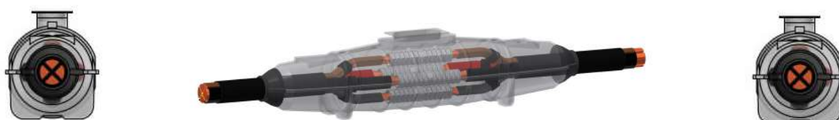
4 Core Copper (D or E) : 4 Core Copper (D or E)