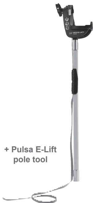
+ Pulsa E-Lift pole tool

In accordance to: EN 12549 EN ISO 11148-13 Directive tool : 2006/42/EC 2011/65/UE 1999/5/EC CEM 2004/108/EC Fuel cell : 75/324/EC Battery : 2006/66/EC Charger : 2006/95/EC CEM 2004/108/EC