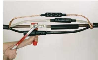
Conductors are spliced using shearbolt connectors Tighten the screw using a socket wrench, until it shears in the cut-off groove.