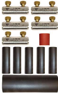
Kit for 5-conductor cable.

The kit consists of shearbolt connectors with partition and heat shrink insulation. The connection between the cable and the through connector is done by means of screws in a shearbolt terminal. Insulation is done with suitable heat shrink insulation.