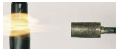
Shrinkage of the insulation is achieved by using heat.