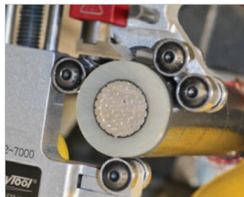
Extra rollers provide tool stability on a range of cable sizes.