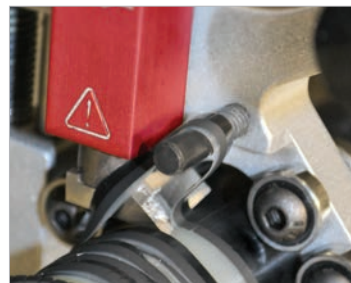
Winding pin keeps semi-con strip from getting in the way.