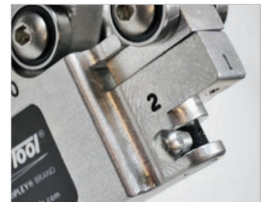
Equipped with four speed positions to optimize performance.