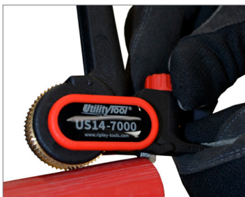
Widened grooves on knob enable easy adjustments to the blade depth while wearing gloves.