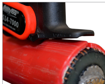
Ground & heat-treated steel blades provide a hardened razor-sharp edge & long term durability.