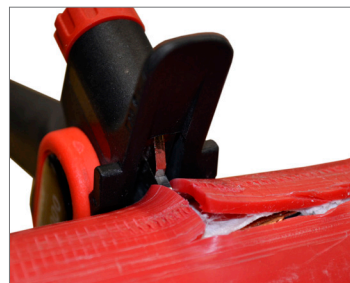
The engineered blade is designed for easy mid span & window-cut entry into ducts.