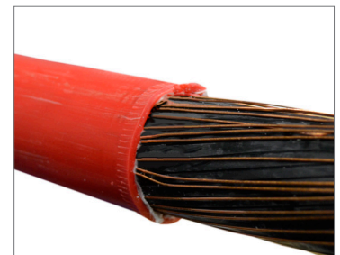
Tool quickly cuts through rugged cable jackets without damaging the underlying layers.