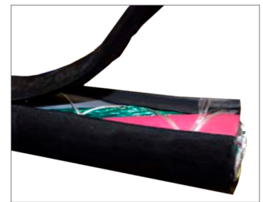
Quickly & easily performs ring, spiral & longitudinal cuts.