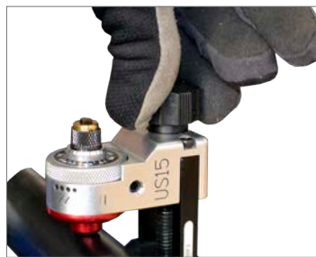
Knobs are engineered with knurls & grooves for easy adjustment when wearing gloves