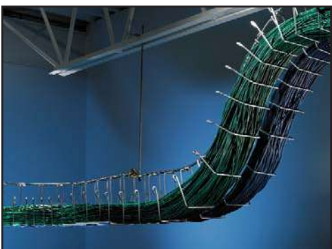
201D Series Snake Tray for Overhead, Under Floors and on Walls