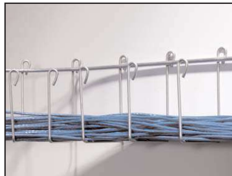
501 Series Snake Tray for Walls