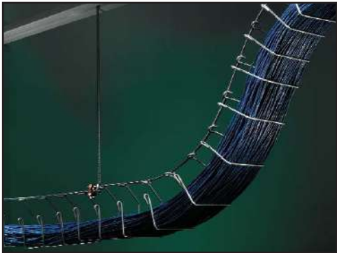
201 Series Snake Tray for Overhead, Under Floors and on Walls