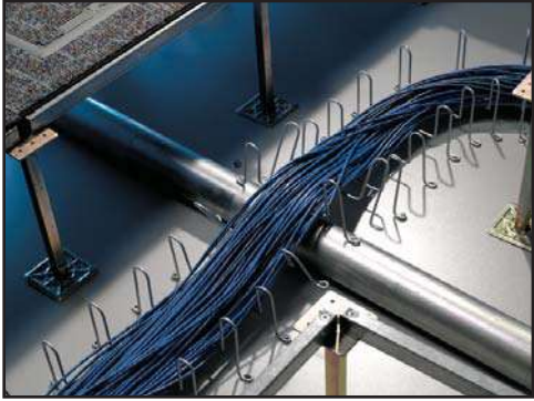
101 Series Snake Tray for Under Floors or Wall Riser