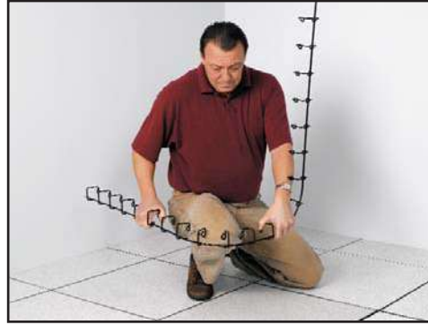
401 Series Snake Race Mini Cable Manager for Overhead, Walls and Under Floors