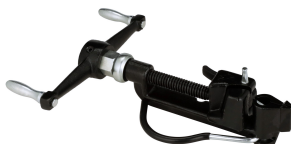
C00369: Heavy Duty Banding Tool