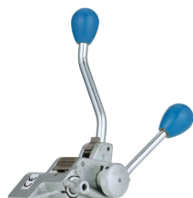
C08569: Bantam Strapping Tool