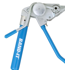
C07569: Bantam Tool