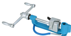
C00169: Standard Banding Tool