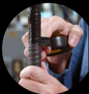
Insulate cable drops