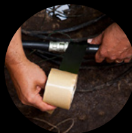
Splicing and sealing in outdoor areas