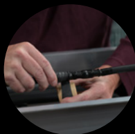
Splice cables in overhead cable trays